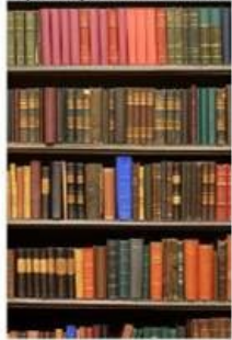
90 th percentile