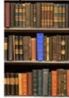
50 th percentile